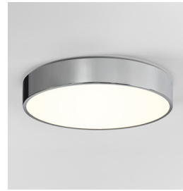
CODE: 1125014 FINISH: POLISHED CHROME