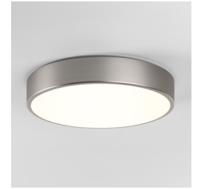
CODE: 1125015 FINISH: MATT NICKEL