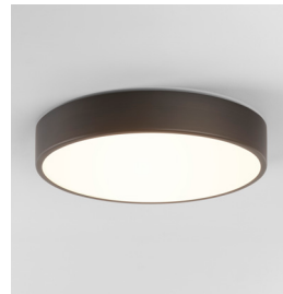
CODE: 1125016 FINISH: BRONZE

TO MAINTAIN THIS PRODUCT TO ITS BEST CONDITION, PLEASE VIEW OUR CARE AND CLEANING GUIDE ON THE SUPPORT SECTION OF THE ASTRO WEBSITE.