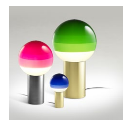
Dipping Light M

LED SMD 10,7W 700mA 2700K CRI90 Luminaire 312lm Light source 948lm (included)