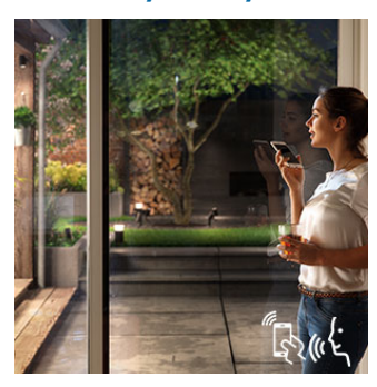
Connect your Philips Hue lights with the Bridge and start discovering the endless

possibilities. Control your lights from your smartphone or tablet via the Philips Hue app, or add the indoor switches to your system to change your lights. Set timers, notifications, alarms, and more for the full Philips Hue experience. Philips Hue even works with Amazon Alexa, Apple Homekit and the Google Assistant to allow you to control your lights with your voice.