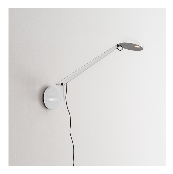
IP20 🕸 🌃 C 🗧