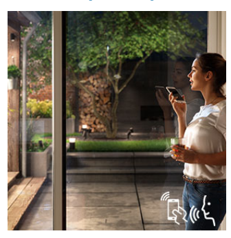
Connect your Philips Hue lights with the Bridge and start discovering the endless

possibilities. Control your lights from your smartphone or tablet via the Philips Hue app, or add the indoor switches to your system to change your lights. Set timers, notifications, alarms, and more for the full Philips Hue experience. Philips Hue even works with Amazon Alexa, Apple Homekit and the Google Assistant to allow you to control your lights with your voice.