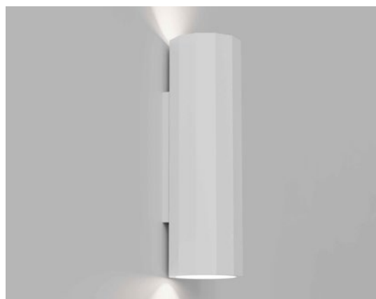
CODE: 1414002 FINISH: PLASTER

TO MAINTAIN THIS PRODUCT TO ITS BEST CONDITION, PLEASE VIEW OUR CARE AND CLEANING GUIDE ON THE SUPPORT SECTION OF THE ASTRO WEBSITE.