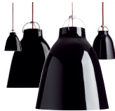
P0, P1, P3, P4 metal